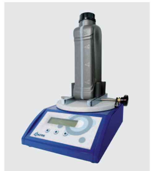
Stud gripping possible for small can with centered cap