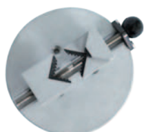
● Mini gripping V-jaws