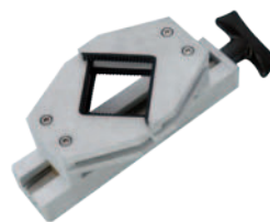
● Large gripping V-jaws

The extra-large gripping V-jaws is available only on request