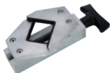
● Small gripping V-jaws